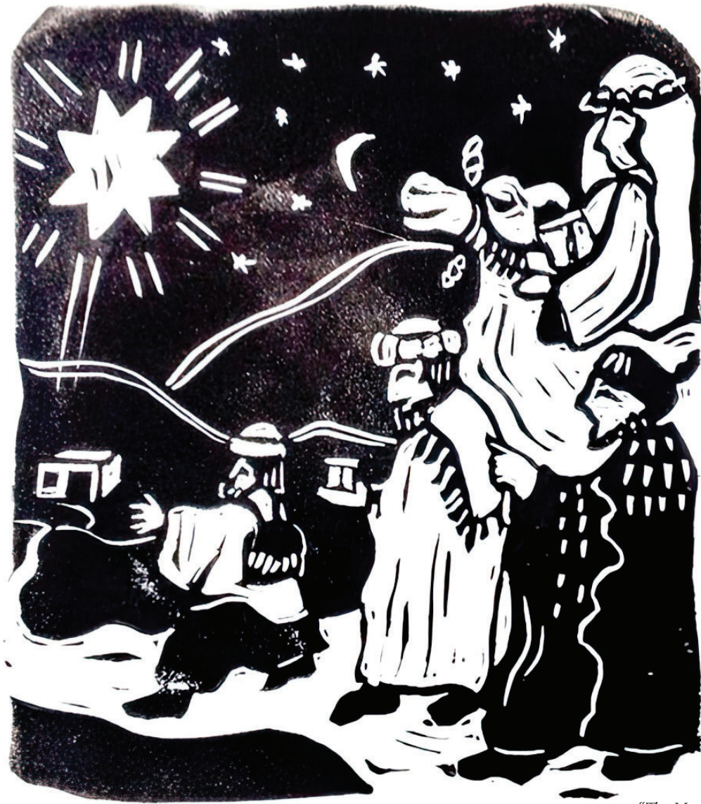
"The Magi" - Cara B. Hochhalter