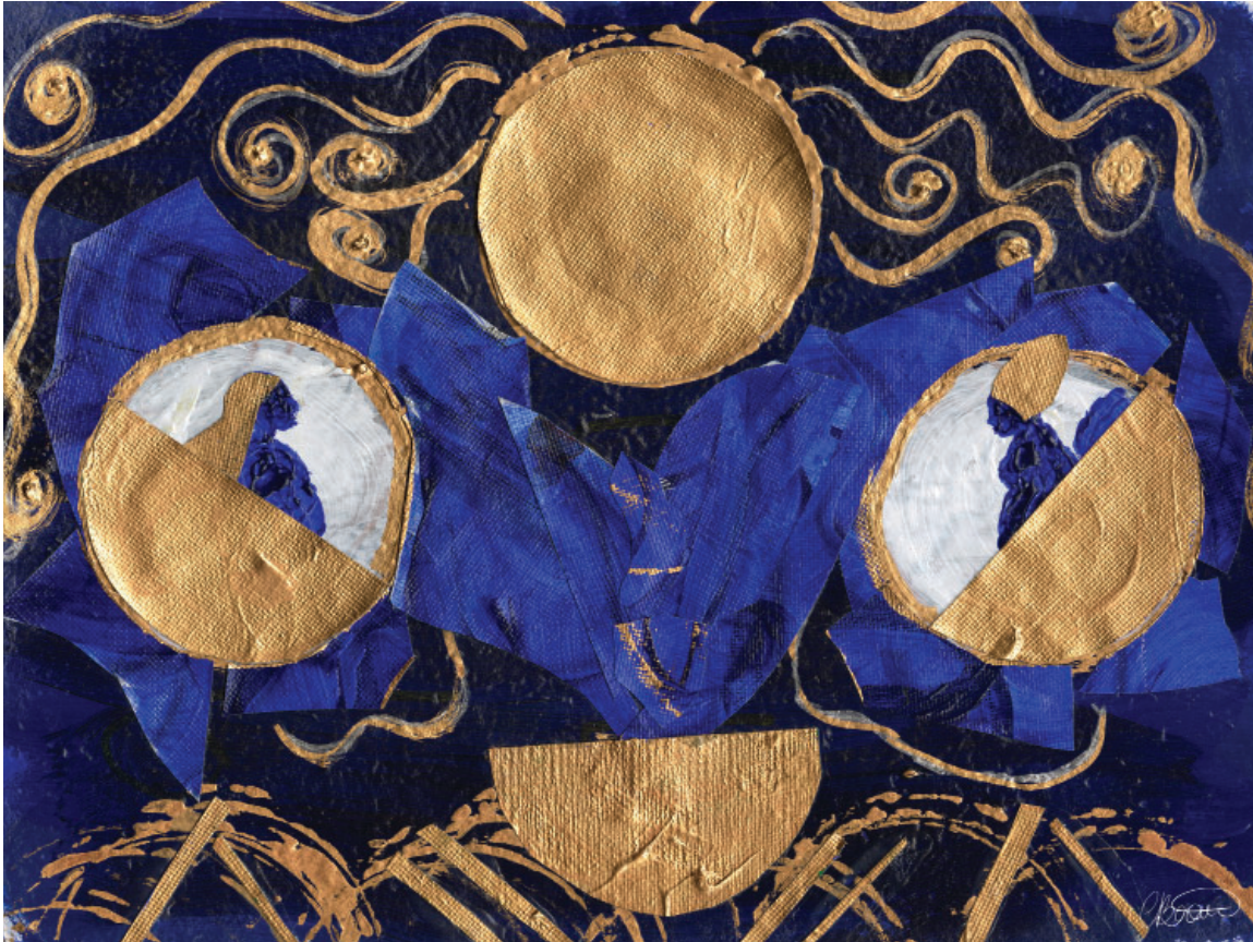
"The Golden Cradle" - Carmelle Beaugelin