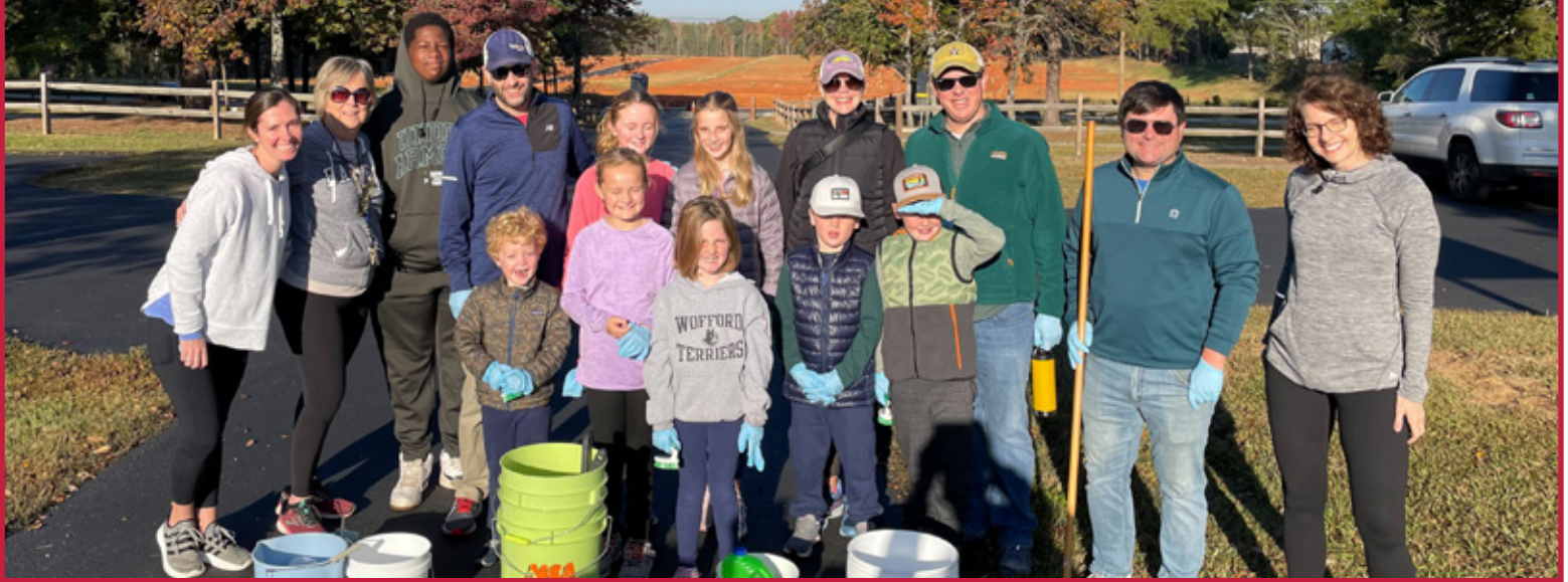
Churchwide Day of Service

“Keep your hand on the plough, hold on.” So go the words to the old African American Spiritual, which serves as the theme for the Chamber Singers’ concert on Sunday, November 6. We could also fairly say that “hold on” is an operational theme of Spartanburg’s Faith Initiative to End Child Poverty, an endeavor First Presbyterian was so instrumental in getting off the ground. The Initiative’s audacious vision is to ultimately end child poverty in Spartanburg. There is no quick fix or easy answers-- it will take a lot of “holding on to the plough” from a lot of people, and for a lot of years, to make this vision a reality.