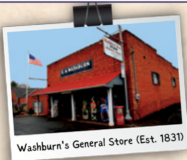
Washburn's General Store (Est. 1831)

Contact Joanie Shackleton to reserve your spot!