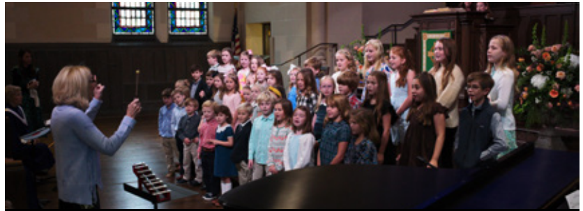
CHILDREN'S CHOIR SINGS FOR MORNING WORSHIP SUNDAY, OCTOBER 9, 2022

First Presbyterian Church Sanctuary Sunday, November 6, 6:00pm