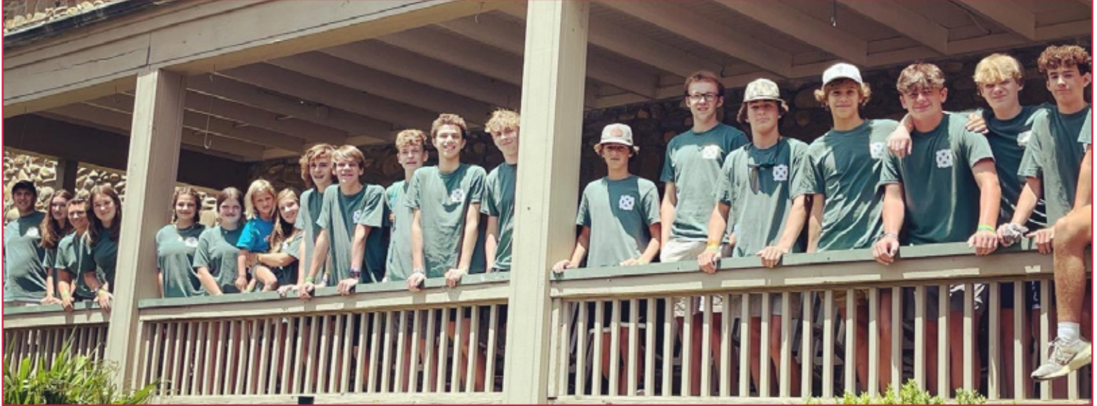
Photo taken at Montreat Youth Conference 2022

Last month, the pastoral and program staff gathered in Lake Lure, NC for a two-day retreat. The focus of our time together this year was on team building and cultivating meaningful connections amongst our group. The latter was especially important given the fact that there are several new faces that have joined our church staff in recent weeks and months – mine included!