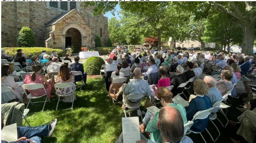
Church on the Lawn May 15, 2022