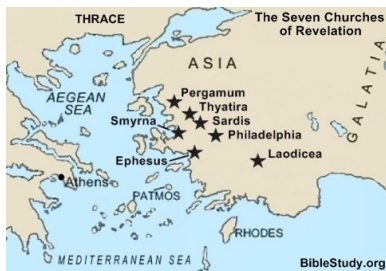
Churches Named in Revelation