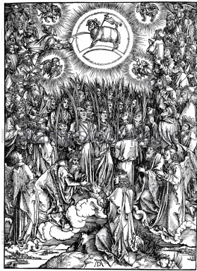
www.alamy.com - D96BD4